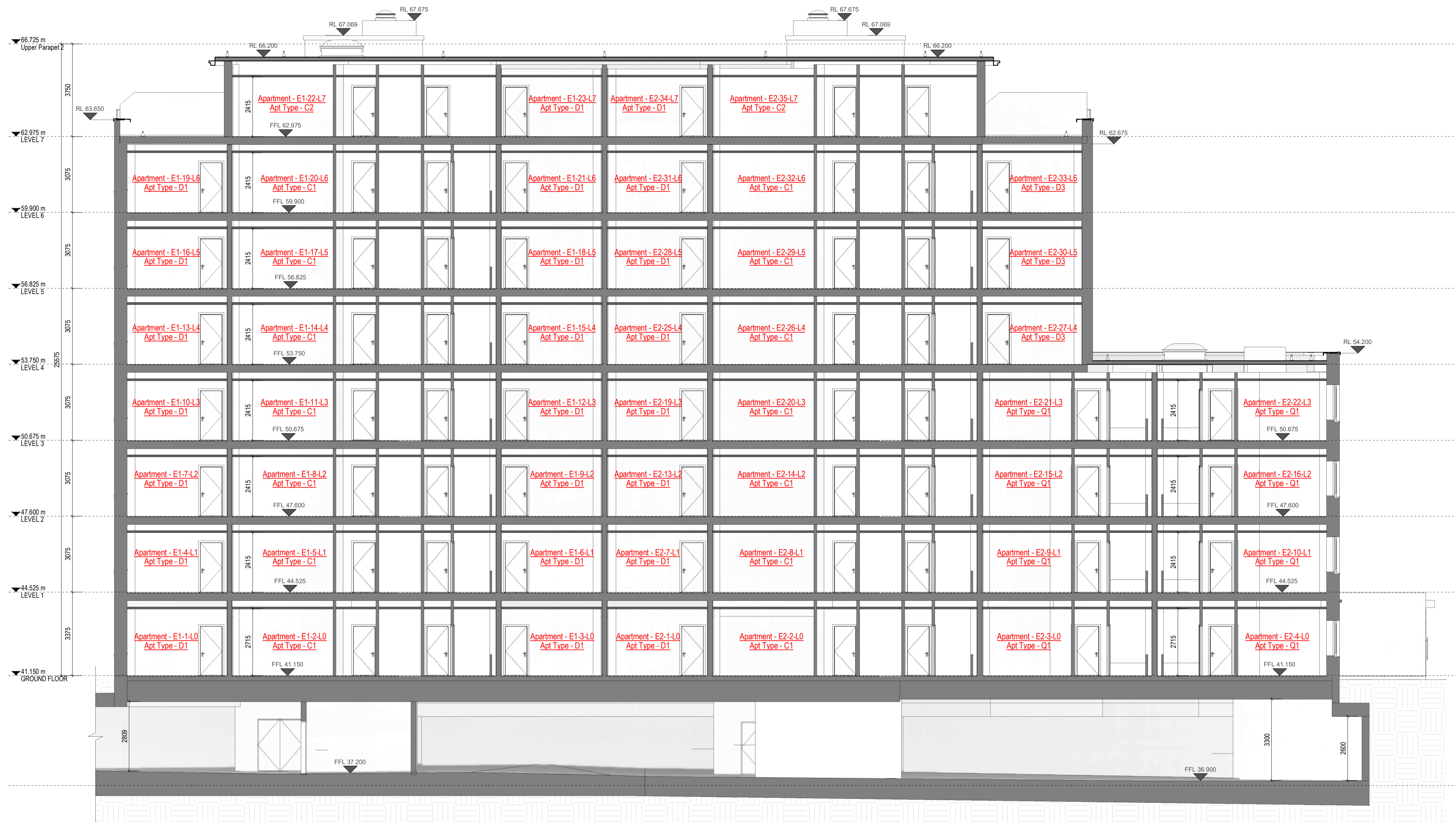
1 GA - Section BB 1:100